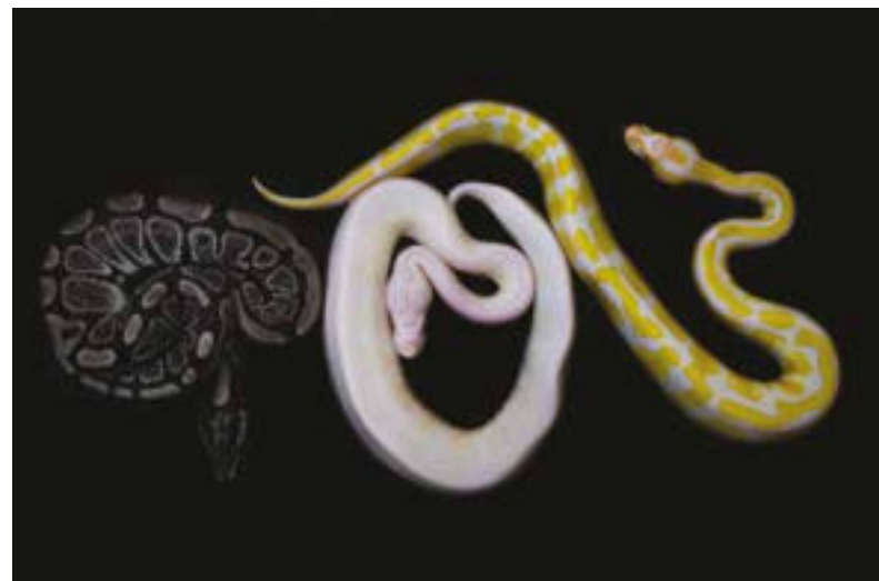
Photo above: Ball python designer morphs on display at a pet expo, Memphis, USA.

A “designer morph” Ball python is the creation of a breeder who has combined two or more “wild morphs” to create something never seen in nature. 91 Some breeders view wild-sourced Ball pythons from Africa as potentially valuable new genetic “stock” that can aid them in their efforts.