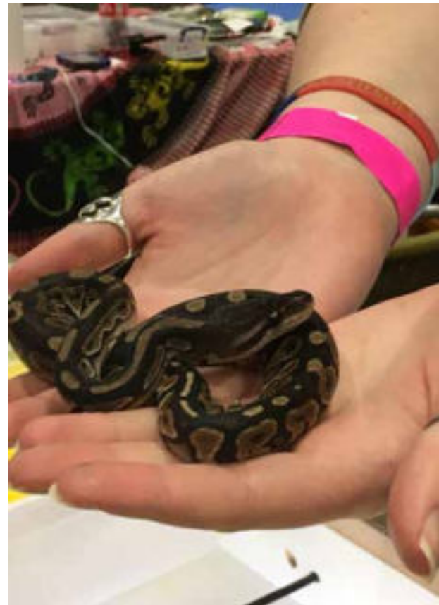
Photo top: At Doncaster reptile expo, Ball pythons are kept in small, tight containers - a welfare nightmare. Photo bottom: Ball python kept in small plastic container while on display at Doncaster reptile expo.