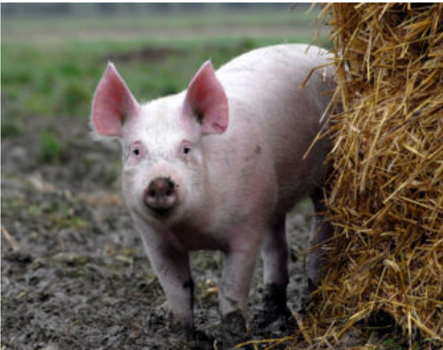
Image: Organic systems usually include outdoor access and have been shown to have reduced antibiotic resistance compared with raised without antibiotic factory farm systems.

Soil Association is one of the organic standards in the UK. They offer many welfare benefits exceeding standard industry practice, including prohibiting cage systems, providing bedding and environmental enrichment, providing free-range access with shade and shelter and monitoring welfare through outcome measures.