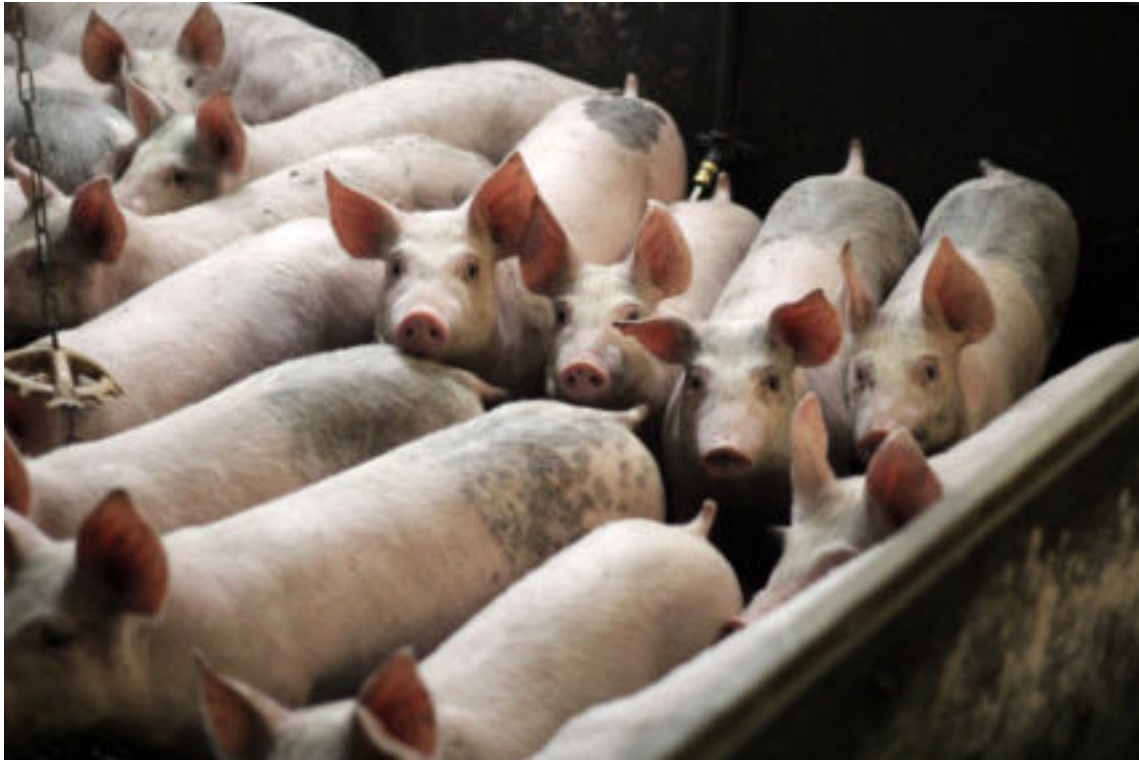
Image: These growing pigs have little space and have had their tails docked.